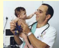
Neonatal Intensive Care Unit at Sourasky Hospital