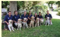
Israel Guide Dog Center for the Blind