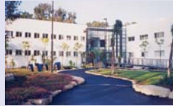
IHF State-of-the-Art Geriatric Center

Offices/Affiliates California • Florida • England • Switzerland • Israel