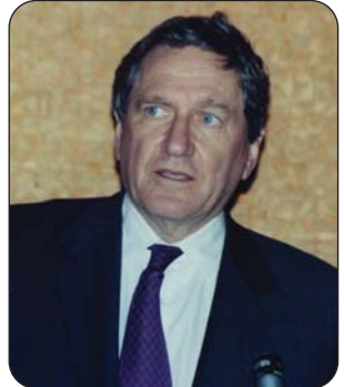
Former UN-USA Ambassador, Richard Holbrooke, a financially savvy diplomat, and personal friend of the UN SG, who has confidence in the importance of his continuing role at the UN.