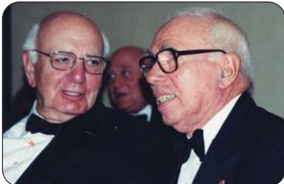
Hon. Paul Wicker, Former Chief of the Federal Reserve comparing notes with Former US Ambassador to France, Hon. Felix Rohatyn, two illustrious financial experts, who can offer practical financial solutions to solve the UN's accountability snafu.