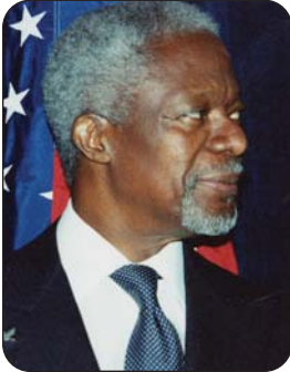
UN Secretary General, Kofi Annan, world leader, renaissance man, and the epitome of a great African statesman.

Kudos For Leadership To Our Celebrities In The Field Of The Arts, Business, Diplomacy, Public Affairs, And Social Graces.