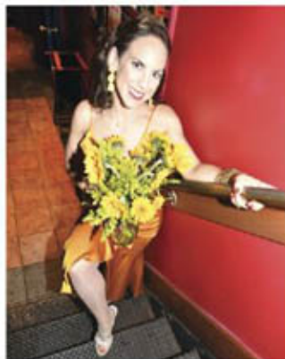
June 21, 2019 - Opening night of "The House that Built Me" at the Laurie Beechman Theatre