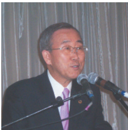
Ban Ki-Moon, Secretary General of the United Nations

For more information please visit: www.landmines.org