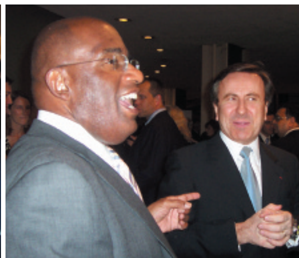
Al Roker and 2007 Honoree Chef Daniel Boulud, Culinary Humanitarian