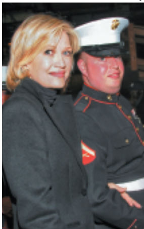
Diane Sawyer and US Marine

The Bob Woodruff Family Fund works with private industry and government to develop public awareness and excellence in research, education, prevention, diagnosis, treatment, support and resources for the injured and their families as they reintegrate to duty or civilian life. Proceeds from the evening and on line auction go to the BWFF. For more information please visit: www.bobwoodrufffamilyfund.org