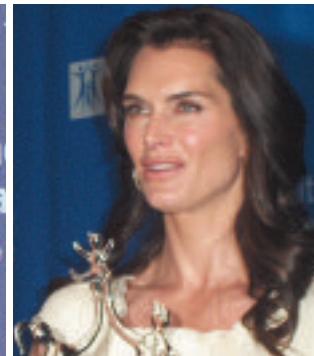
Honoree, actress Brook Shields at The City of Hope, East End Chapter/Jeanne Kaye League "Woman of the Year" Luncheon. www.cityofhope.org