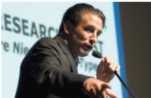
Billy Baldwin at The 2007 Gala Concert benefitting Dana's Angels Research Trust. www.danasangels.org