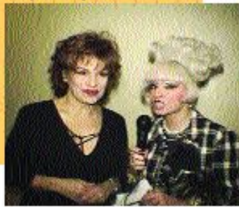
Joy Behar from "The View" with Cognac