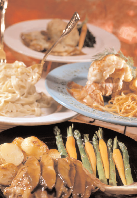
Entrees such as Piccatina di Vitello and Fettuccine con funghi e aragosta.

tally associates with Italian restaurants. Service is professional, personable and adept.