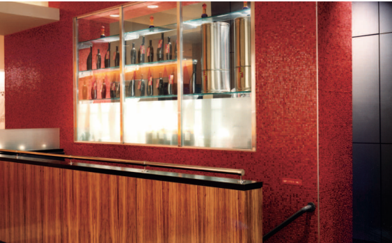
Il Frontoio, this mosaic wall serves as a beautiful backdrop to Alfredo's bar.

Sauces are remarkably fresh and light. Each entity retains their own individual characteristic personalities, whether dynamically herby or made with the complexity of meat-infused types like Bolognese.