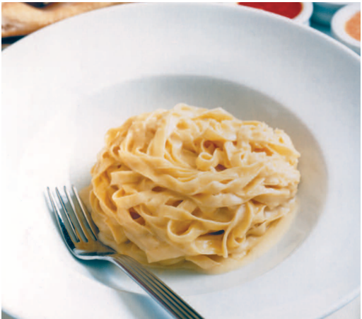
The original Fettuccine Alfredo as no one else can make it.

As rivalry between Italian kitchens steadily heats up, Alfredo of Rome responds by increasingly augmenting unconventional choices. Pastas, which are central to the restaurant's bill-of-fare, embraces skillful concoctions of fragile, feathery-light, unique and uniquely delicious noodles, rendered perfectly slender or wide, as called for in the chef's recipe. Daily preparations of homemade ravioli, fettuccine Alfredo (a decades-old staple here), flashy risotto's and countless other supple surprises awaits, filling your nostrils with seductive aromas.