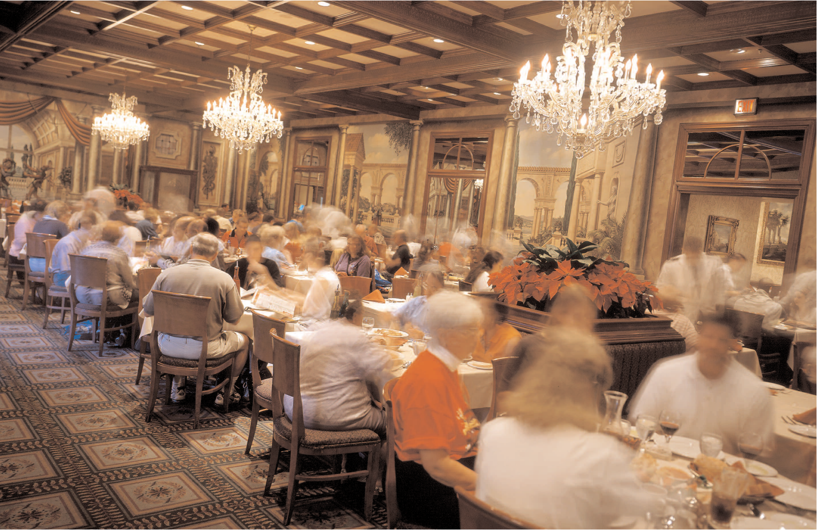
Interior shot shows Alfredo’s Neo-classical architecture in EPCOT

Within Disney's Orlando, Florida's Epcot Center, stands the imposing, authentically-stylized Italian Pavilion. This exhibit is indeed dominated by the commodious, crowd pleasing rendezvous tagged Alfredo of Rome, a longtime shrine of liberated Italian cooking. It should be noted that it shares this distinction with its sister restaurant, the more intimate and refined, Alfredo of Rome, set in the heart of New York's Rockefeller Center (West 49 St.).