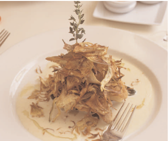
Carciofi alla Giudia, crunchy artichokes Roman Jewish ghetto style with radicchio salad.

Just so you know, this Alfredo of Rome turned its roomy interior into a series of unduly inviting, virile inspirations, thus bravely breaking the traditional mold one fundamen-