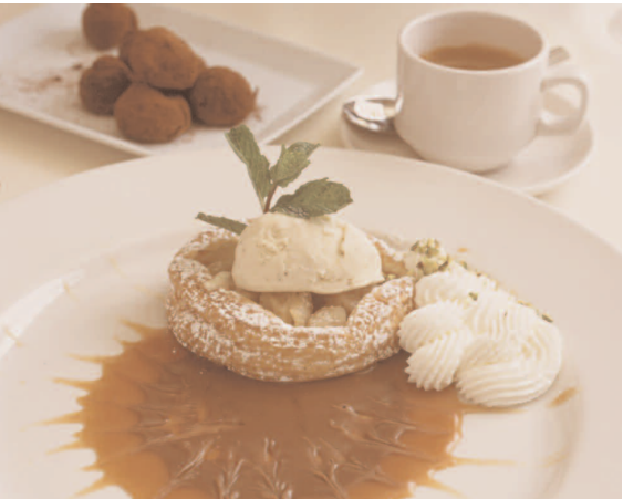
Il Finocchio, warm, candied fennel tart with Sambuca ice cream and milk chocolate sauce.