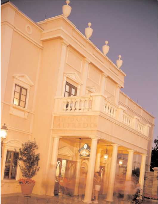
Exterior at dusk of Alfredo’s in EPCOT.