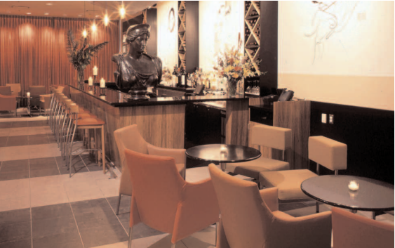
Alfredo of Rome, New York. Art Deco inspired bar and lounge.