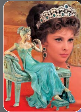
"Paolina Borghese" the famous sister of Napoleon Bonaparte that Gina portrayed in the film "Imperial Venus". Bronze with 24 carat gold finishing 76x52x73 (h) cm.