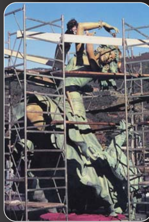
Gina working on patination of Esmerelda, bronze, 16-1/2 feet high, 2001