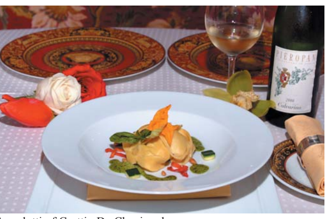
Agnolotti of Crottin De Chavignol