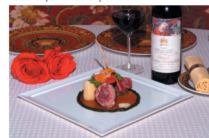
Roasted Rack & Grilled Saddle of Colorado Lamb