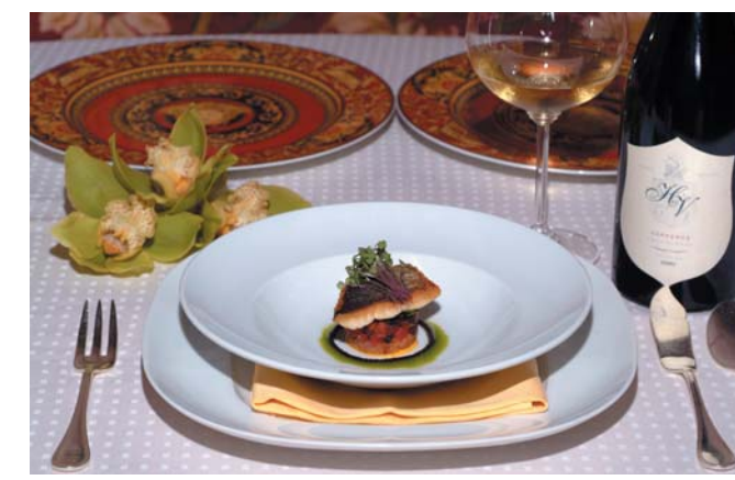
Dourade Royale Bourride