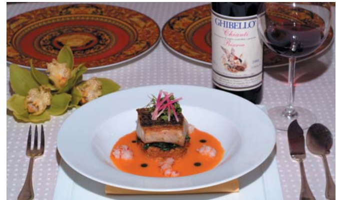
Filet of Salmon, Carrott-Ginger Emulsion