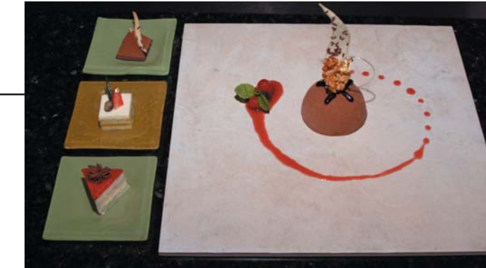
Chocolate Bombe with Carmelized "Rice Krispies", Savory Caramel, and Malt Ice Cream