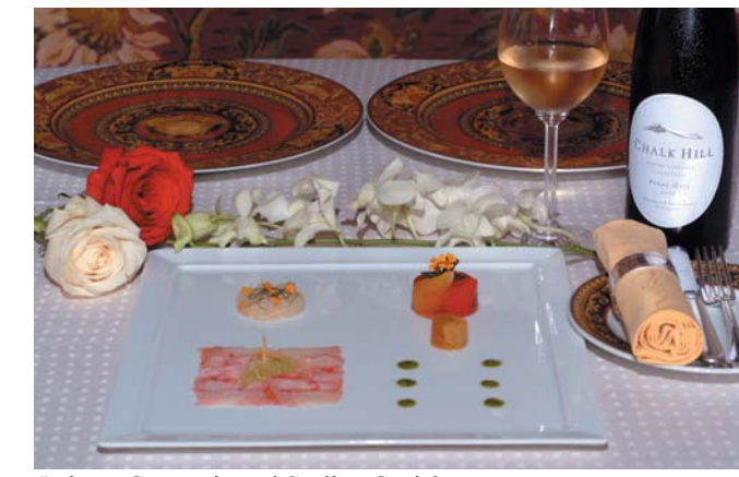
Lobster Carpaccio and Scallop Ceviche